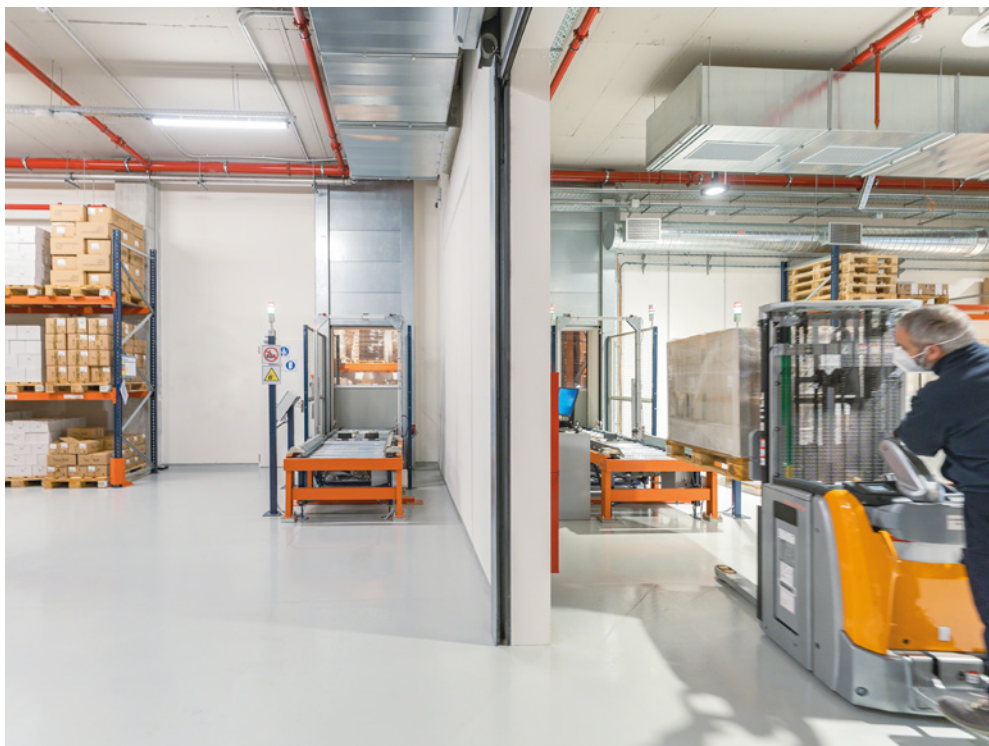
All inbound and outbound goods access points in the automated warehouse are reversible.

To gain in capacity, Mecalux dug an 26-foot-deep pit where it set up taller 39-foot racking. These racks occupy all of the area's useful space, with entry and exit points and conveyors placed strategically alongside them. The objective was clear: "We wanted to make the most of the limited space we had to obtain the largest number of locations possible," emphasizes Pilar López.