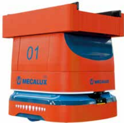
AMR 100 Box

These robots adapt to multiple intralogistics transport requirements. Thanks to their versatility, the AMR line covers a wide range of loads weighing up to 3,307 lb.