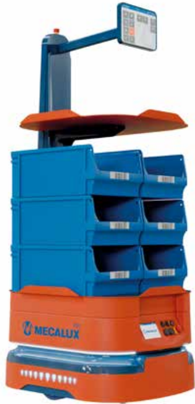
AMR 100 Multi-Box