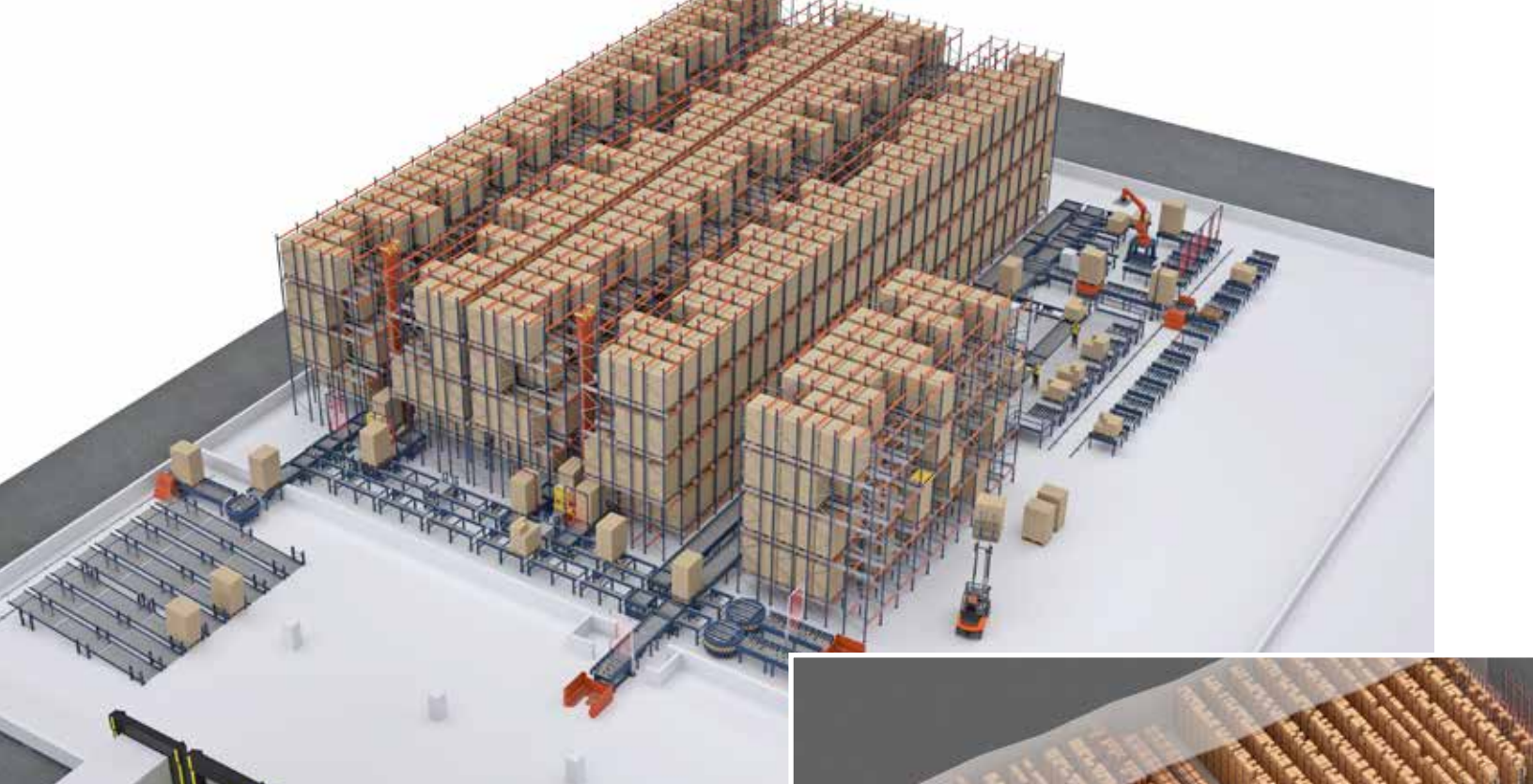
SEE THE COMPLETE CASE STUDY